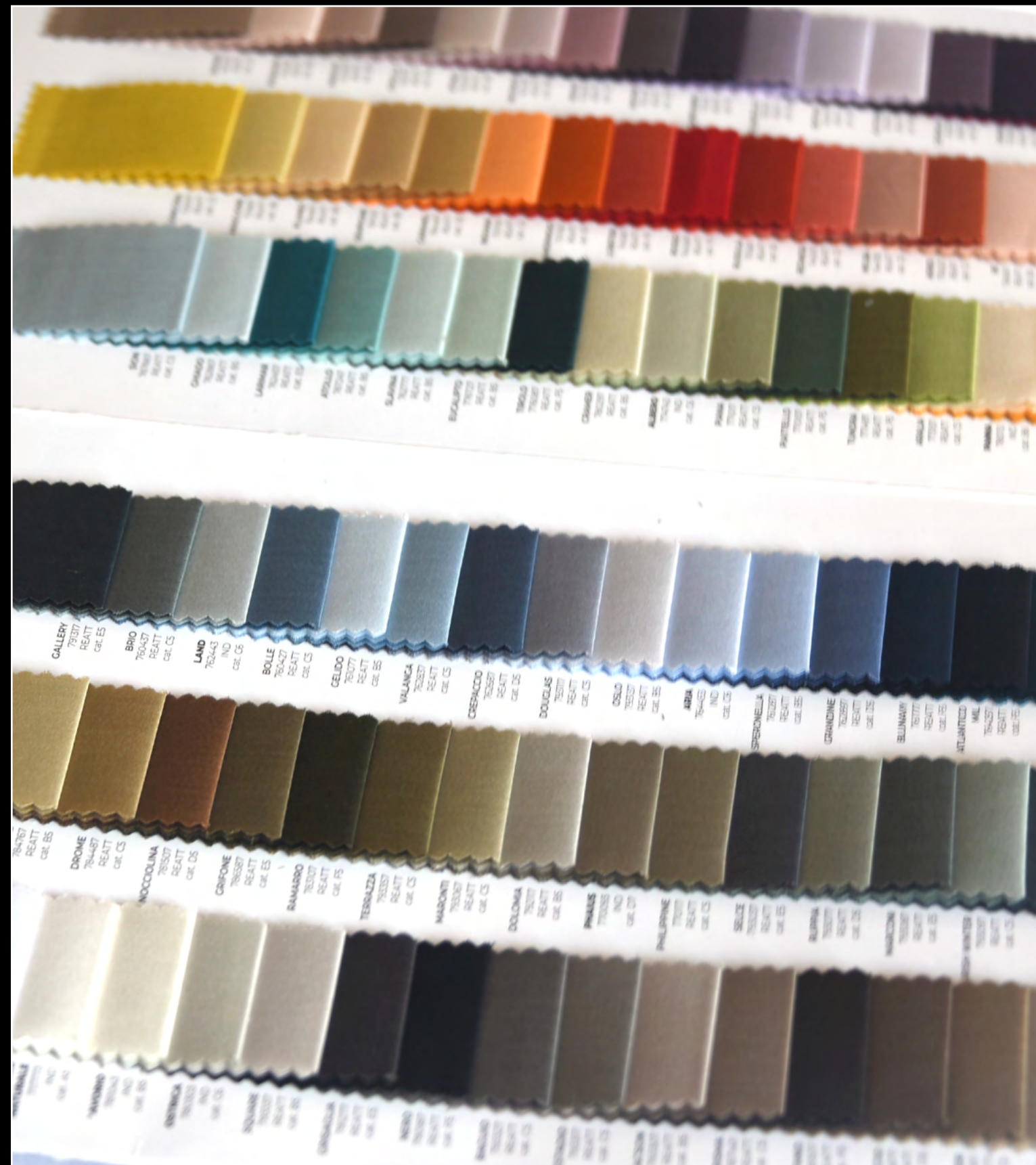
Possibility to choose between 48 available colors

Discover our new collection of bedding designed for the highest standards of health and well-being.